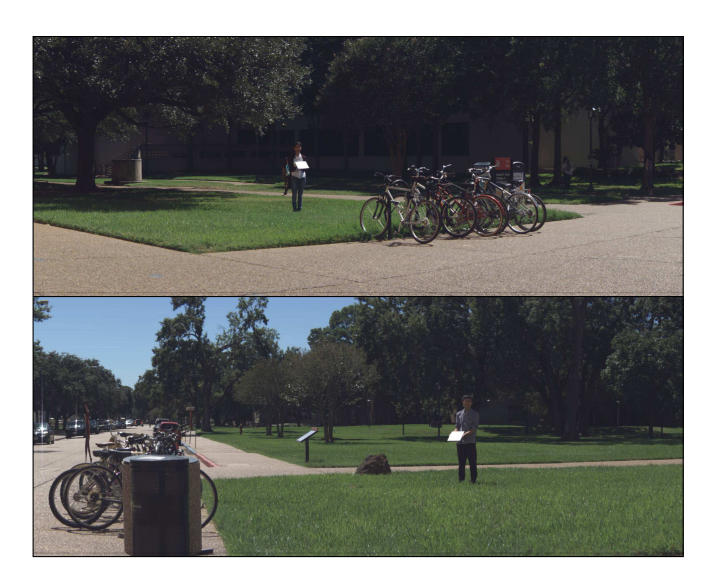
Fig. 1. Scenes used for testing: HSI was collected for the two outdoor scenes shown above. Color images were generated using the spectral profile of the e2v EV76C560 camera sensor to provide realistic measurements for broadband color filters. Ground truth labeling of top scene was used to train the classifier while the bottom scene was reserved for testing. Gamma correction has been applied for display purposes.

Depending on the imaging scenario, further restrictions are placed upon the rows of A. Each row of A corresponding to a narrowband measurement is required to have a single